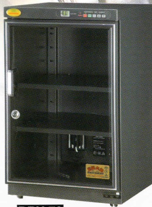
DRY-70 EX: W400 × D442 × H652mm IN: W398 × D385 × H576mm CAPACITY: 88L SHELF: 2PCS WEIGHT: 17KGS MAX/AVG 23W/5W