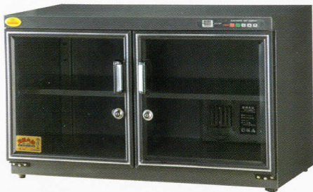
DRY-120L EX: W806 × D430 × H480mm IN: W804 × D375 × H405mm CAPACITY: 122L SHELF: 2PCS WEIGHT: 20KGS MAX/AVG 30W/7W