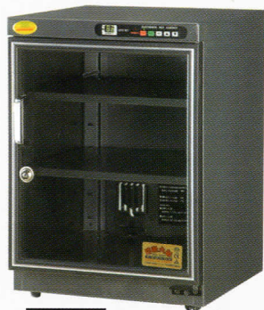
DRY-60 EX: W400 × D442 × H556mm IN: W398 × D385 × H480mm CAPACITY: 71L SHELF: 2PCS WEIGHT: 15KGS MAX/AVG 23W/5W