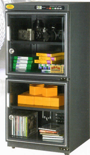
DRY-100 EX: W400 × D442 × H882mm IN: W398 × D385 × H808mm CAPACITY: 124L SHELF: 3PCS WEIGHT: 20KGS MAX/AVG 30W/7W