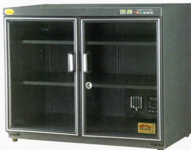
DRY-190L EX: W806 × D480 × H656mm IN: W804 × D420 × H575mm CAPACITY: 194L SHELF: 2PCS WEIGHT: 26KGS MAX/AVG 30W/12W NO MIDDLE PILLAR